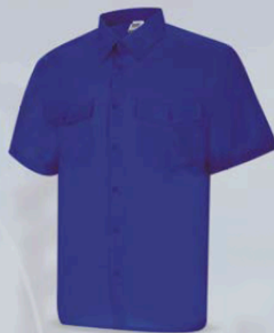
388 CAMC Tergal, Royal blue