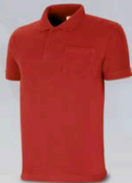
1288-POLR 100% COTTON, Red