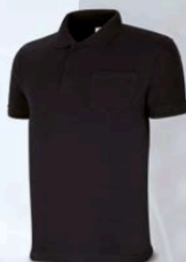
1288-POLN 100% COTTON, Black