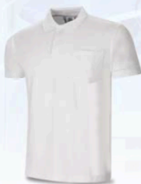
1288-POLB 100% COTTON, White