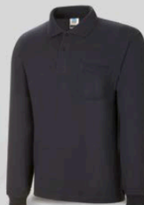
1288-POLNML 100% COTTON, Black