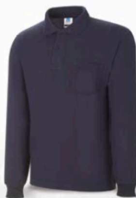
1288-POLAML 100% COTTON, Navy blue