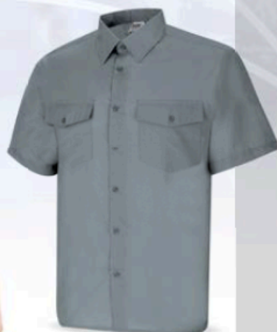
388 CGMC Tergal, Grey