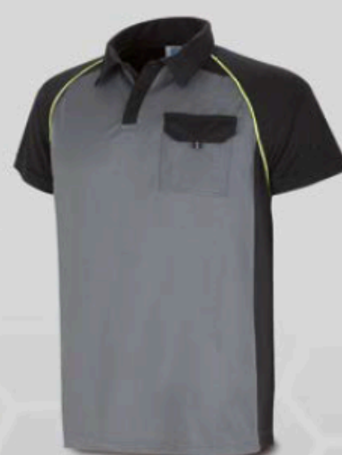
1288-POLGN Dark gray/black