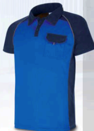
1288-POLAZA Royal blue/navy blue