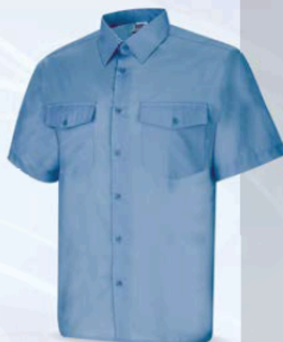
388 CCMC Tergal, Light blue