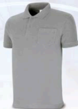
1288-POLG 100% COTTON, Grey