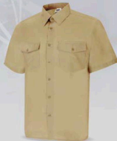
388 CMMC Tergal, Beige