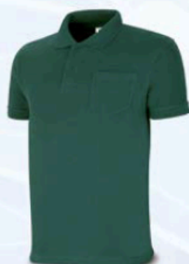
1288-POLV 100% COTTON, Green