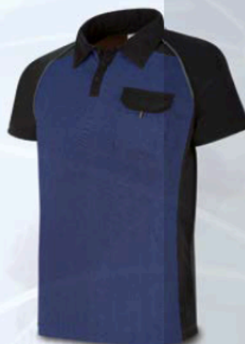
1288-POLAN Navy blue/black