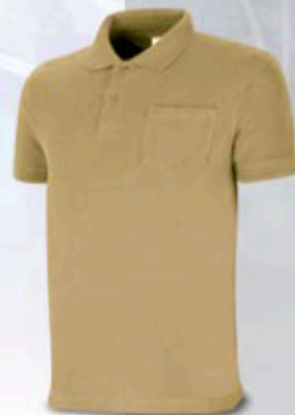
1288-POLM 100% COTTON, Beige