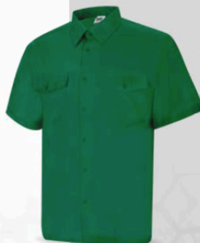
388 CVMC Tergal, Green