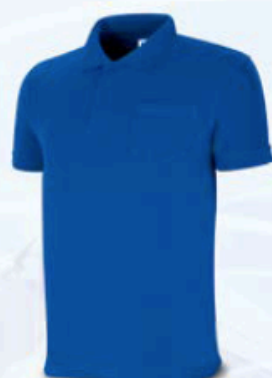
1288-POLZ 100% COTTON, Royal blue