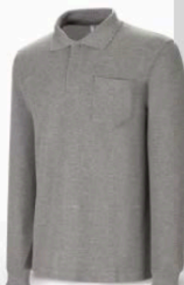
1288-POLGML 100% COTTON, Grey