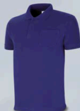
1288-POLA 100% COTTON, Navy blue